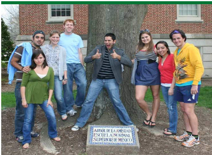
UNC Students hosted Mexican students from the Universidad Iberoamericana in March of 2010