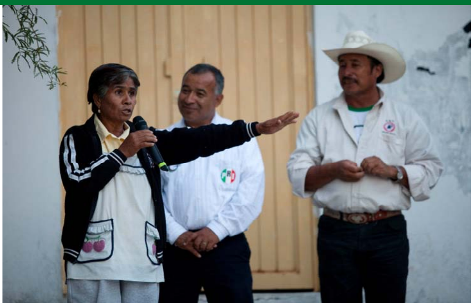
Photo: Public speaker in a Guanajuato community.

In January 2011, The Latino Migration Project and the Southern Oral History Program will inaugurate a new collection of oral histories documenting the integration of Latinos in North Carolina. Students from APPLES Global Course Guanajuato, INTS 390, have recorded and transcribed 50 interviews with Latinos in North Carolina on a variety of subjects. Students connect to Latino communities by volunteering in organizations that provide services to migrants in Orange County. The collection will continue to grow as The Latino Migration Project provides students with training in ethnographic methods. The interviews are archived in Wilson Library and will be available online.